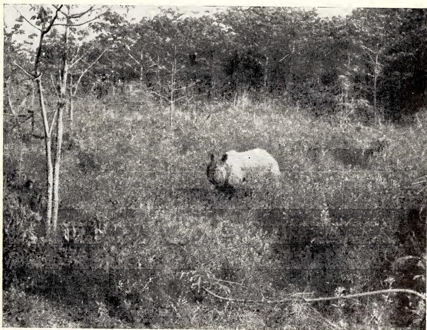
Rhino in typical habitat in the Rapti River Valley, Nepal